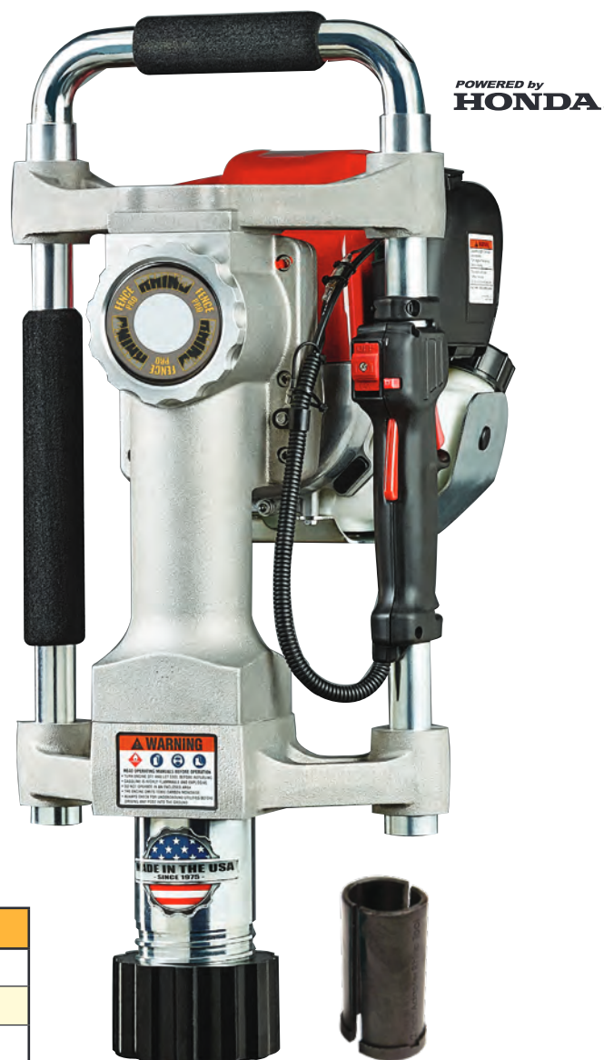
Model No. 301001

Fence Pro™ Post Driver includes a 2" adapter